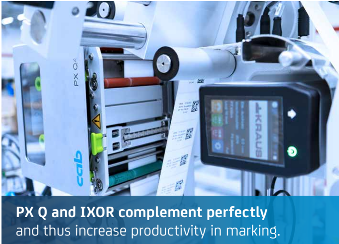
PX Q and IXOR complement perfectly and thus increase productivity in marking.

PX Q is a module designed by cab for pure continuous printing in industrial environments. Several thousand labels can be printed per day and the printed labels in subsequence provided, for example to be applied by a labeling head, in this case an IXOR. Printed labels are provided to the right or left. The print module is 25 cm wide, 30 cm high and less than 40 cm deep, making it easy to integrate. The print method is thermal transfer. Depending from the field of operation, thermal markings remain legible during processing and storage, resist extreme temperatures, liquids and solvents. Sharp-edge definition and high contrast enables even smallest information be verified on a label.