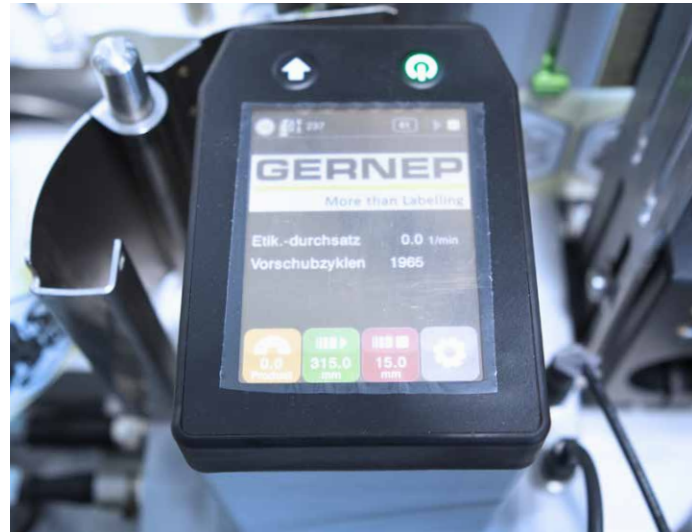
IXOR operated intuitively via touchscreen